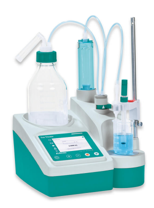
Figure 1. The Eco Titrator from Metrohm equipped with a Unitrode with integrated Pt1000.

An appropriate amount of sample is pipetted into the titration beaker, then deionized water is added. Afterwards, the solution is titrated until after the first endpoint with standardized sodium hydroxide.