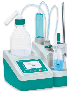
Figure 1. Eco Titrator equipped with a Unitrode with integrated Pt1000.

An appropriate amount of sample is pipetted into the titration beaker and then deionized water and sodium chloride are added. Afterwards, the solution is titrated until after the third endpoint with standardized sodium hydroxide.