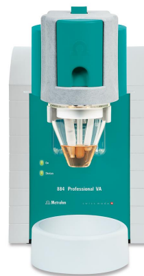
Figure 1. 884 Professional VA manual for MME.

The lfp sample is weighed, mixed with degassed diluted sulfuric acid, heated at 85 °C for 15 minutes, and then cooled. Afterward, the digested sample solution is added to the measuring vessel that contains 20 mL degassed electrolyte. Quantification is done using two standard additions with separate Fe(II) and Fe(III) solutions.