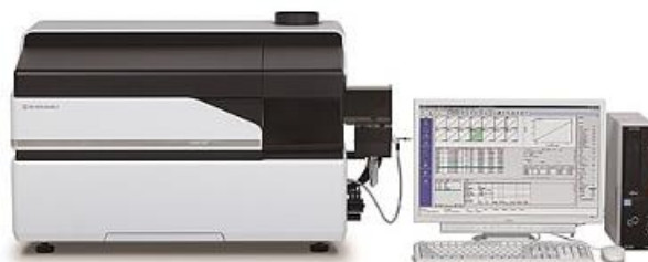
Figure 1: ICPMS-2030

All analyses was carried out on Shimadzu ICPMS-2030 coupled with mini torch and AS-10 autosampler. The detailed instrument configuration and operation parameters were summarized in Table 1. Helium collision cell provides an effective way to remove possible polyatomic spectral interferences. The cell gas mode was applied for all the elements except for Li and Sb as shown in Table 2. The instrument was tuned and optimized using a mixed tuning solution and warmed up to 30 minutes before measurement.