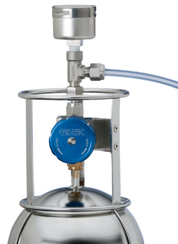
Figure 3 Sampler installed on a canister