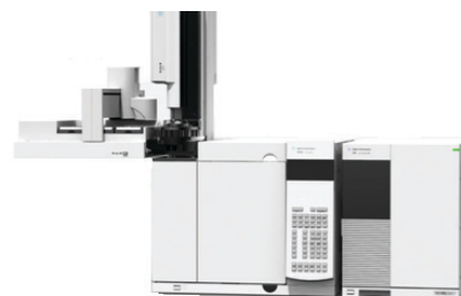
The Agilent 240 Ion Trap MS connected to the Agilent 7890A GC