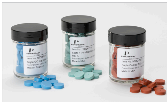
Figure 1. GC Inlet Septa Portfolio.

We offer a range of inert septa, suited to different application needs. The BTO (orange) septa offer the ultimate in inertness and are ideally suited to GC/MS applications and trace analysis. The mid-range advanced green septa combine low inlet adhesion properties with long lifetime and are recommended for GC applications. The blue septa offer a high-performance cost-effective alternative, offering a good level of inertness and are also recommended for GC applications.