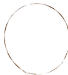
Pre-measured Deactivated Tubing