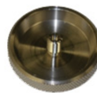
SilTite FingerTite™ Pre-swage Tool