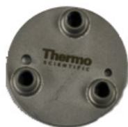
No Vent Microfluidics Tee