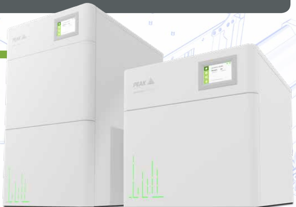
Genius XE 70

There are two models to suit your flow requirement, Genius XE 35 (up to a total of 35 L/min) and Genius XE 70 (up to a total of 70 L/min), both sharing many of the unique benefits with the main differences being size, number of internal compressors (2 and 4, respectively) and of course total output flow. The XE 70 is ideally suited to serving multiple instruments, eg. 2 or even 3 mass-spectrometers from one compact footprint solution.