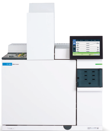
Agilent 8890 GC system

Choose from standard configurations for extended refinery gas, fast refinery gas, fixed gases, and flue gas. Or customize a refinery gas analyzer, based on either the 8890 GC or the Agilent 990 Micro GC system, to meet your specific requirements.