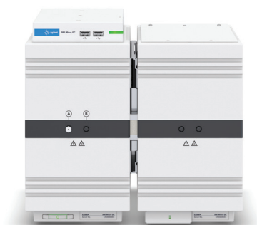
Agilent 990 Micro GC system