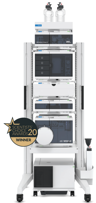
Agilent InfinityLab LC/MSD iQ with the 1260 Infinity II Prime LC in the InfinityLab Flex Bench MS.

Plus, if you act now, you can take advantage of our Technology Refresh program discount.