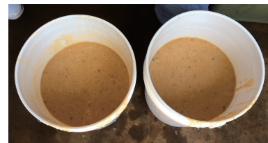
Fig. 3 Food Waste Slurry (Raw material for methane fermentation)

Fig.3 shows food waste slurry which is raw material for methane fermentation. Fig. 4 shows methane fermentation residue which is digestion effluent after fermentation. In order to achieve stable methane fermentation, the ratio of carbon and nitrogen (C/N ratio) in the raw material must be within a certain range. IRI Shizuoka Pref. measures TOC and TN of the raw materials to adjust the C/N ratio and to calculate the gas generation efficiency. TOC and TN of the digestion effluents are also measured to calculate the decomposition rate and to evaluate fertilizer components.