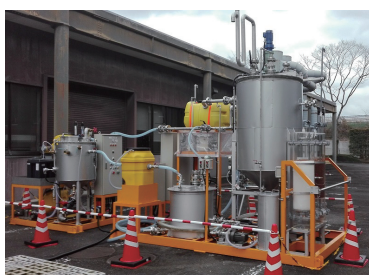
Fig. 2 Transportable Methane Fermentation Pilot Plant

IRI Shizuoka Pref. is developing a high-efficient and low-cost methane fermentation plant for small-scale food processing companies. In early 2017, a transportable methane fermentation pilot plant with a 1,000 L fermentation tank shown in Fig.2 was developed by industry-academia-government collaboration team. Starting from 2017, the team sets up the pilot plant at various kinds of food processing factories to verify fermentation performance and cost efficiency of each food waste. The test results will be disclosed as model case to encourage other food processing companies to adopt methane fermentation plant in the prefectural area.