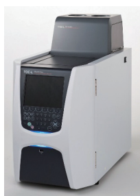
Fig. 6 TOC-L Total Organic Carbon Analyzer + TNM-L Total Nitrogen Unit