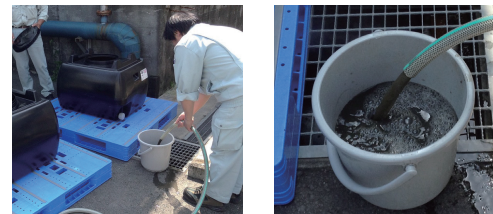
Fig. 4 Methane Fermentation Residue (Digestion effluent after methane fermentation)