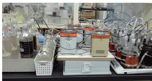
Fig. 5 Laboratory-scale Methane Fermentation Test System

In addition to the transportable methane fermentation pilot plant, IRI Shizuoka Pref. has a laboratory-scale methane fermentation test system shown in Fig. 5. Food wastes from food processing companies are tested with the laboratory-scale system and examined whether they can proceed to the pilot plant test or not.