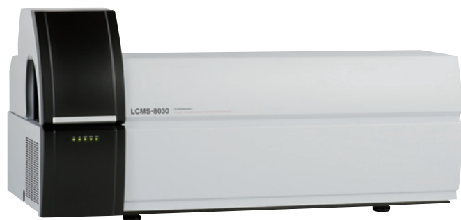
Fig. 1 LCMS-8030 Triple Quadrupole Mass Spectrometer

In this Technical Report, we used the LCMS-8030 triple quadrupole mass spectrometer (Fig. 1) to evaluate whether or not 10 pesticide compounds used to spike a matrix at 10 ppb each could be detected automatically by using generic peak detection method in the screening for 176 pesticides using 1 msec pause and 5 msec dwell times.