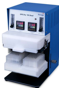
Figure 3. Biotage® SPE Dry™ evaporator.

Samples were eluted into a 2 mL collection plate on the Extrahera™ system. All samples were evaporated to dryness at 40°C with 20 L/min of nitrogen using a Biotage SPE Dry™ (shown in Figure 3). Extracts were then reconstituted with 100 µL of 90:10 mobile phase A/mobile phase B and analyzed via LC-MS/MS.