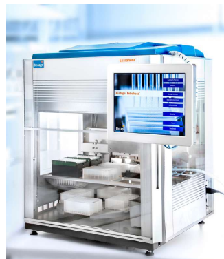
Figure 1. Biotage® Extrahera™ Automated Extraction System.

Both the hydrolysis and extraction were performed on the Biotage® Extrahera™ automated system. Urine samples (100 µL) were aliquoted into a 96-well plate. The plate was loaded onto the Extrahera™ system (Figure 1).