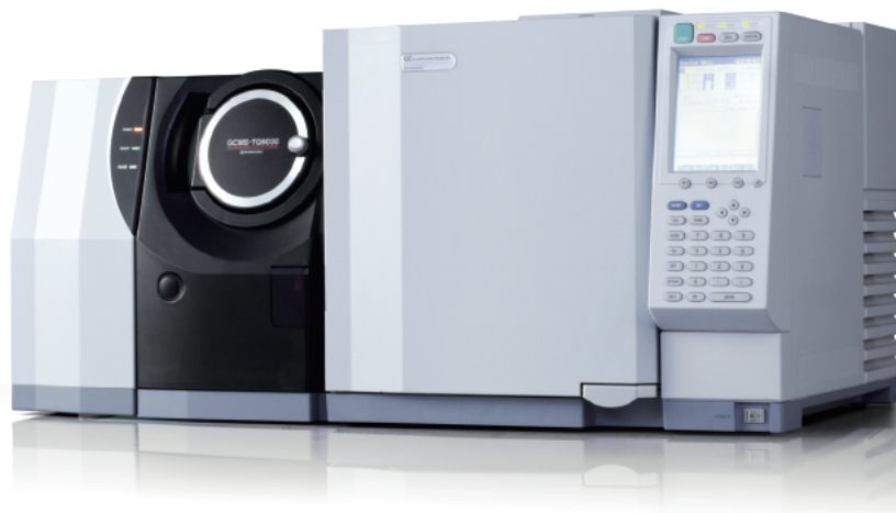
Figure 1: The information content that may be generated from a single sample is enhanced by the use of simultaneous scheduled-MRM for targeted screening and a scan event for untargeted screening. The full scan data may also be used for profiling of sample populations and characterisation of the matrix. Simultaneous acquisition is enabled by UFMS capable GCMS and GCMSMS systems.

platforms (Figure 1). Electron ionisation (EI) and chemical ionisation (CI), with methane, isobutane and ammonia as reagent gases, were assessed for selectivity and sensitivity.