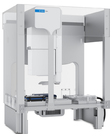
The Agilent Bravo has nine deck positions and can be configured with interchangeable 96- or 384 disposable tip heads.