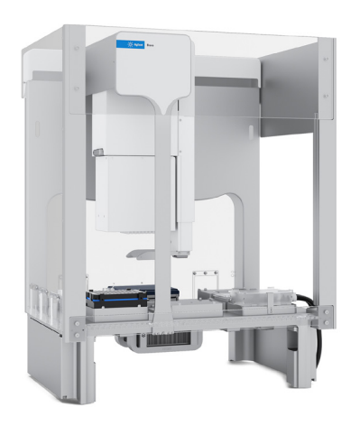
The Agilent Bravo has nine deck positions and can be configured with interchangeable 96- or 384 disposable tip heads.