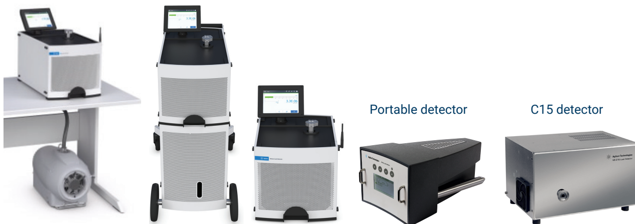
Figure 3. Agilent portable, benchtop, and mobile leak detectors designed for the accumulation sniffing mode.