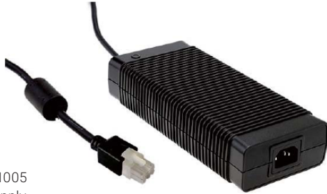
X3514-81005 power supply

TwisTorr 305-IC pumps with integrated controller need 24V input voltage: Agilent offers a power supply 24V, with part number X3514-81005 . The power supply is equipped with 3 power cables for EU / US / China (cable power supply length is 1 m).