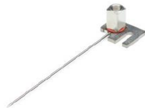
Needle assembly 1290 vialsampler, G7129-87201