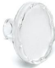
Glass filter, solvent inlet, 20 µm pore size, 5041-2168