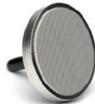
Stainless steel filter, solvent inlet, 10 µm pore size, 01018-60025