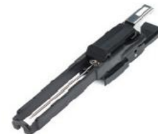
Needle assembly multisampler, G4267-87201