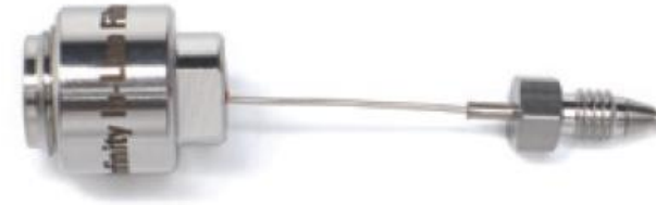
Infinity LC inline filter, 5067-6189